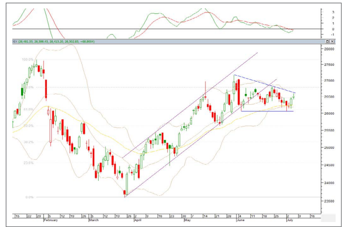
Bank Nifty Daily