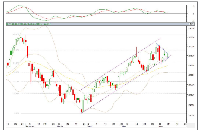
Bank Nifty Daily