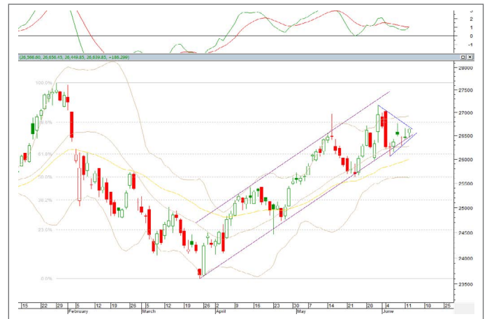
Bank Nifty Daily