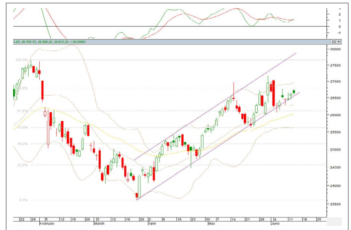
Bank Nifty Daily