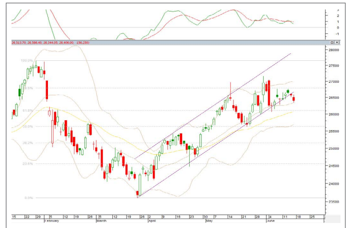
Bank Nifty Daily