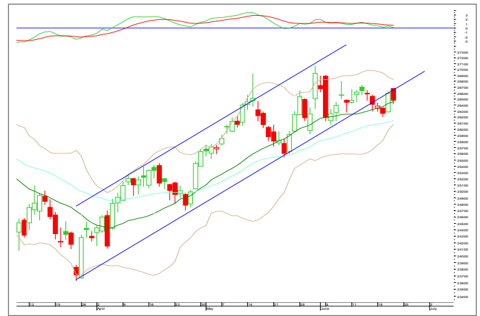
Bank Nifty Daily