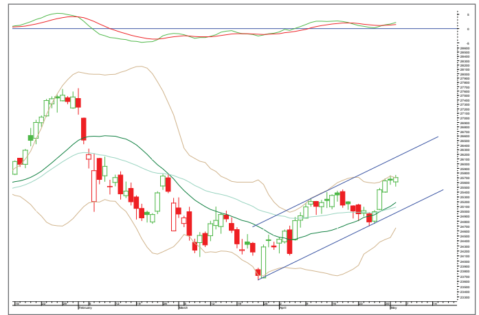
Bank Nifty Daily