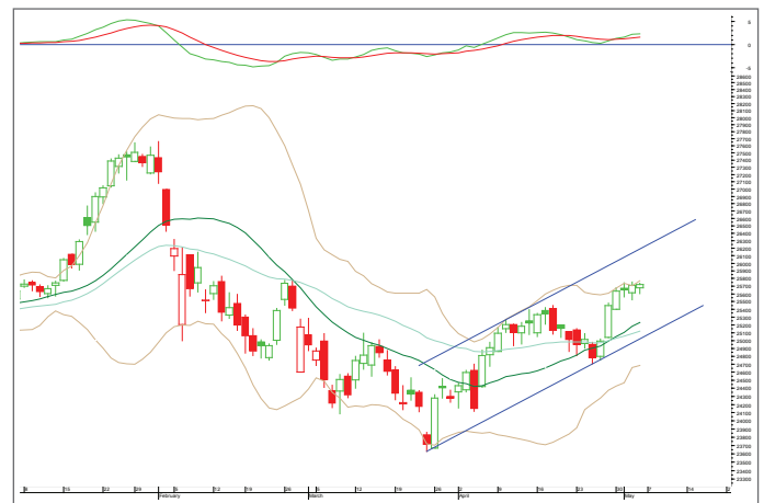
Bank Nifty Daily