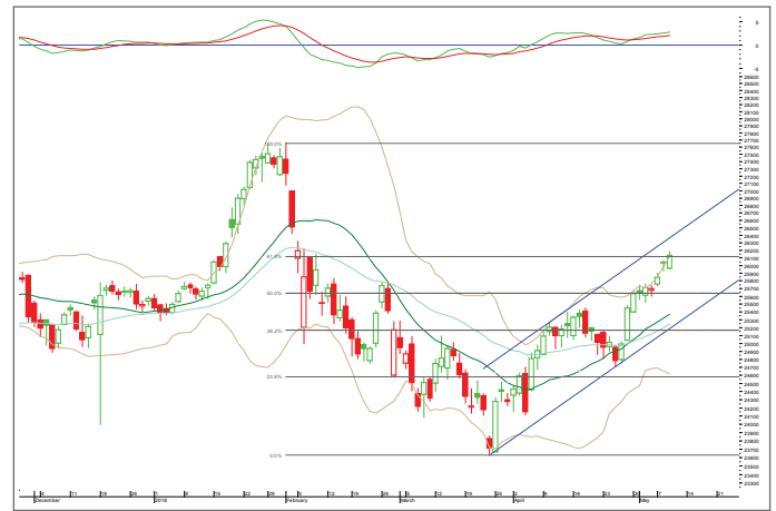
Bank Nifty Daily