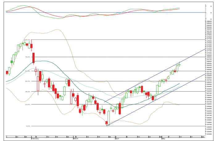
Bank Nifty Daily