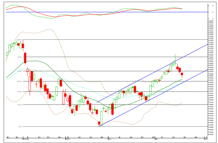
Bank Nifty Daily