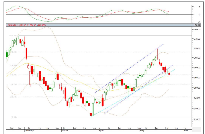
Bank Nifty Daily